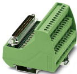
VARIOFACE module, with screw connection and D-Subminiature pin strip, for mounting on NS 35 rails, with LED, 25-pos.

Please be informed that the data shown in this PDF Document is generated from our Online Catalog. Please find the complete data in the user's documentation. Our General Terms of Use for Downloads are valid ( http://phoenixcontact.com/download )