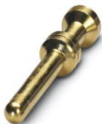
Turned 2.5 crimp contact, individual male contact, core diameter 0.75 to 1.0 mm 2 , gold-plated

Please be informed that the data shown in this PDF Document is generated from our Online Catalog. Please find the complete data in the user's documentation. Our General Terms of Use for Downloads are valid ( http://phoenixcontact.com/download )