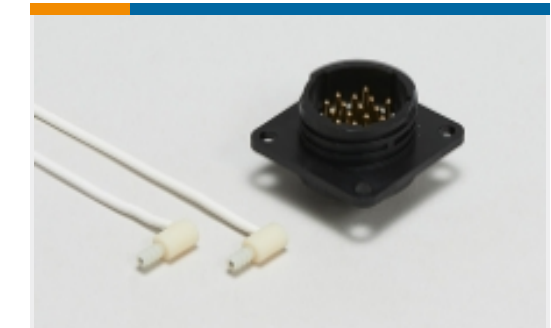
Circular Power Connectors(467)