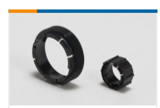
Circular Connector Adapters(7)