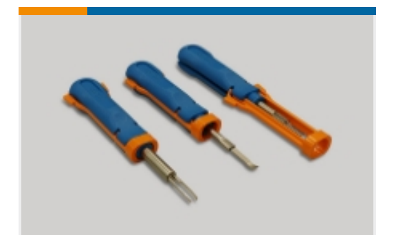
Insertion & Extraction Tools(1)