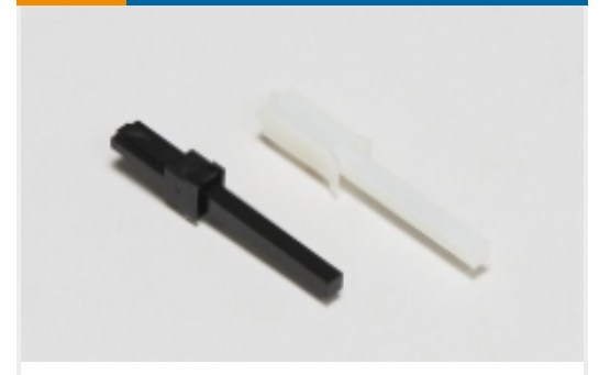
Circular Connector Keying Plugs(2)