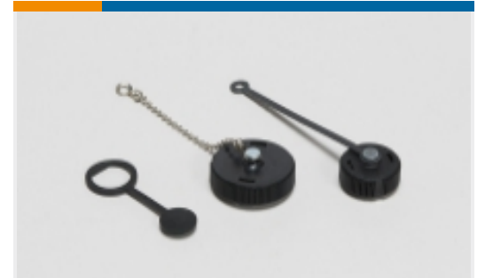
Circular Connector Caps & Covers(16)