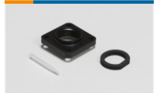
Circular Connector Seals(36)