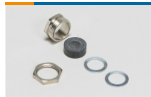
Circular Connector Hardware(3)