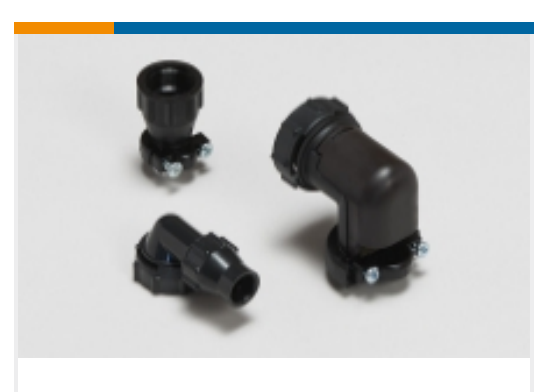
Unscreened Circular Connector Backshells & Clamps(56)