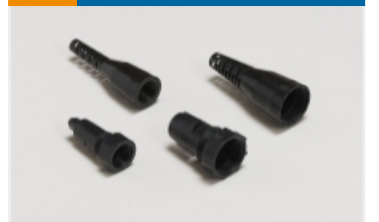
Circular Connector Boots & Strain Relief(6)