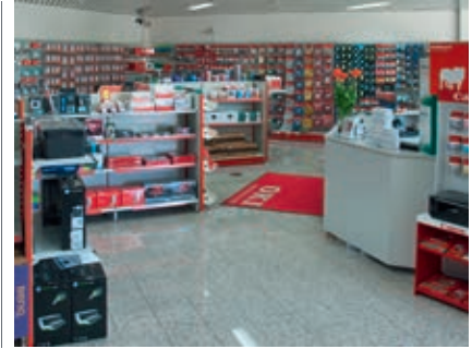
Indoor air quality