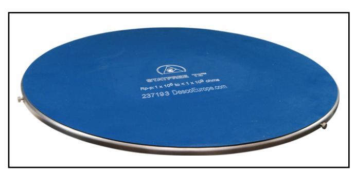
Figure 1. Desco Europe <u>237193</u> Gyro-Stat® ESD Bench Top Turntable