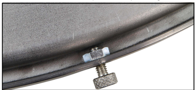
Figure 2. Thumbscrew Locks

*The Gyro-Stat® Bench Top Turntable may also be used on a floor or other surface. In order to be grounded it must be on a surface that provides a path to ground.