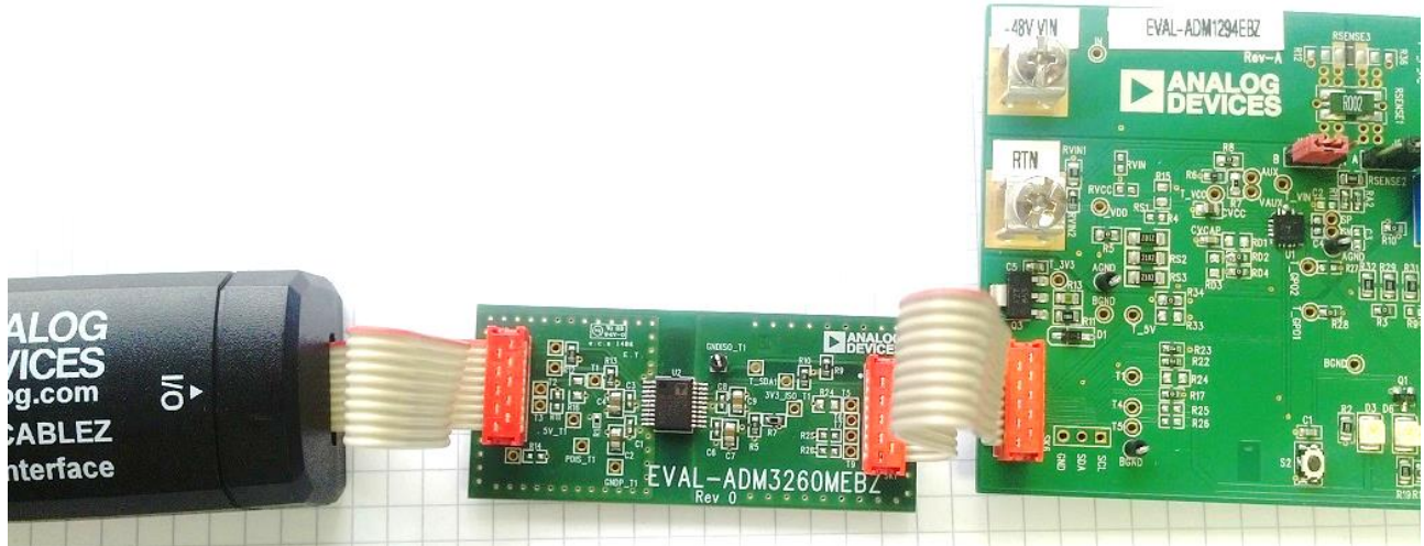
Figure 2. Board Connection Example