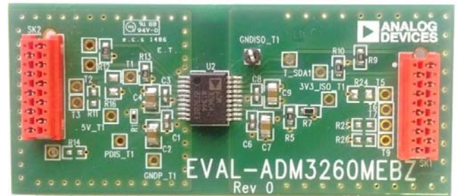
Figure 1. EVAL-ADM3260MEBZ Evaluation Board

evaluation kit while I 2 C signal communication and power delivery is still maintained.