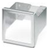
DIN rail adapter for EEM-MA600 and EEM-MA400 energy meters

DIN rail adapter - EEM-MKT-DRA - 2902078