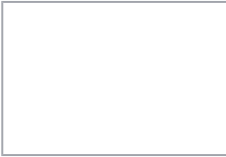
Push-in termination of solid conductors and fine-stranded conductors with ferrules