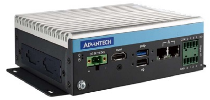
Advantech MIC-710AI AI Inference System

For this, the MIC-700Al series brings Al inference to the edge. Designed around the low-power NVIDIA Jetson Nano using advanced thermal engineering, the fanless MIC-710Al operates on 24VDC power in temperatures from -10° to +60°C. With an M.2 SSD, it handles a 3G, 5 to 500 Hz vibration profile.