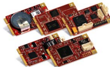
Mini PCIe Modules