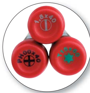
Colour-coded drive symbols on the rotating cap for easy recognition of the individual screwdrivers.

The PicoFinish is distinguished by top-quality materials and an ergonomic handle design. The comfortable precision screwdriver with multi-component handle, rapid rotating zone and easy-movement rotating cap is a professional tool for all precision work for confined screw applications. To make things even easier for the user working with tiny screws, we've developed a second, smaller handle. The colour-coded marking of the drive symbol on the rotating cap is also new. This makes it easier to recognise the individual screwdrivers when several are being used at once.