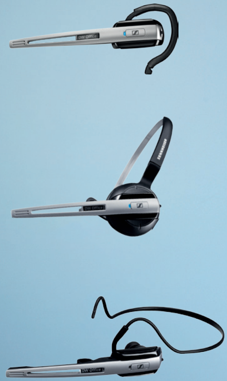
Note: Neckband available as accessory