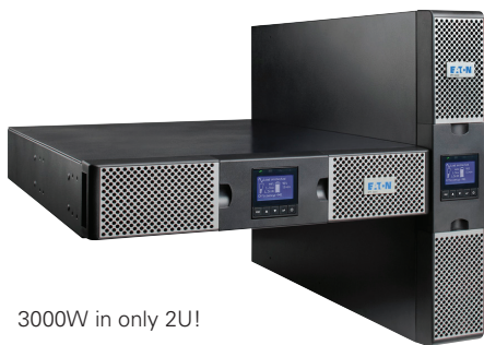
3000W in only 2U!