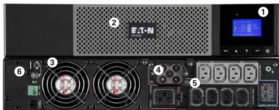
Eaton 5PX 3000i RT2U