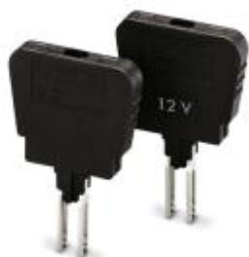
Fuse plug, Nominal current: 6.3 A, Length: 33.1 mm, Width: 6.1 mm, Height: 26.5 mm, Color: black

Please be informed that the data shown in this PDF Document is generated from our Online Catalog. Please find the complete data in the user's documentation. Our General Terms of Use for Downloads are valid ( http://phoenixcontact.com/download )