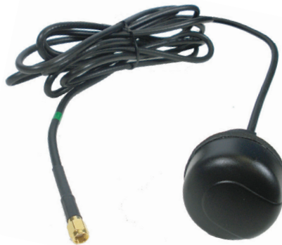
WAN11RSP low-profile dome antenna, through-hole screw mount