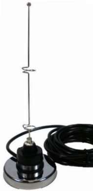
WAN10RSP straight mobile antenna, magnetic mount