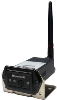
WPB1 WPMM mounting bracket