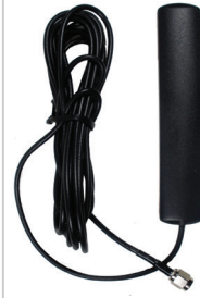
WAN03RSP flat design, adhesive mount