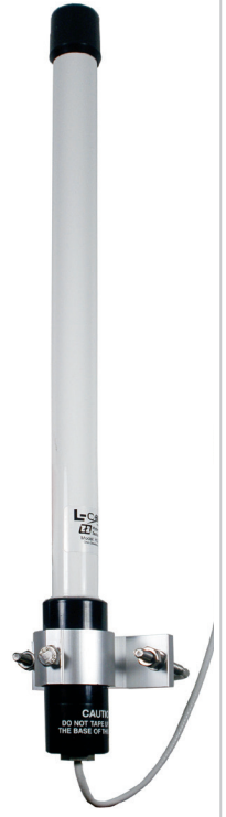
WAN06RNJ straight design, bracket mount