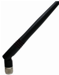
WAN02RSP tilt & swivel design, direct mount connector