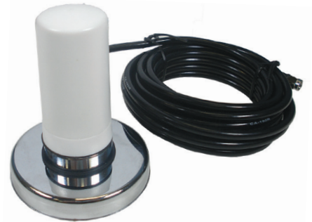
WAN09RSP low-profile mobile antenna, magnetic mount