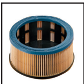
Cellulose Filtercardridge FP 3600 (3600 cm 2 filtersurface) 99,8% dust retention