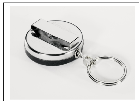
Belt loop fitting