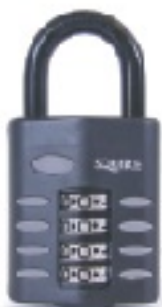
CP50 - Open shackle