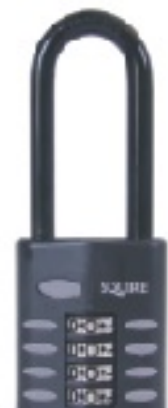
CP502.5 - Extra long shackle