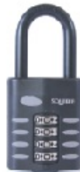
CP501.5 - Long shackle