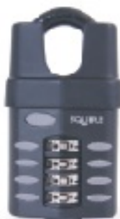
CP50CS - Closed shackle