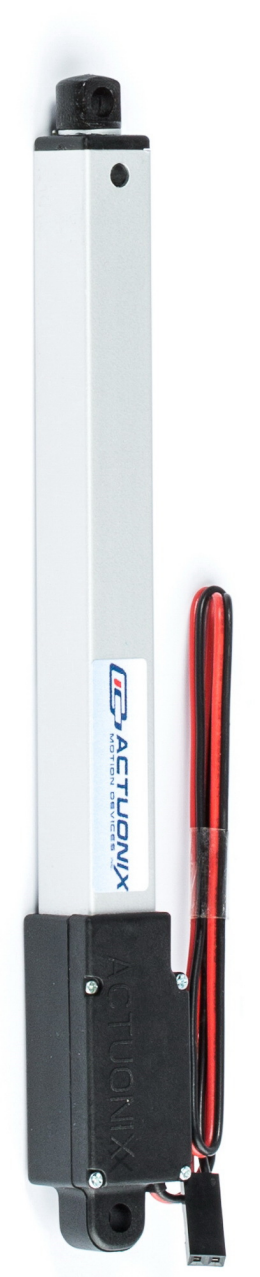
100mm L12 Actuator Actual Size