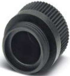
Sealing cap, 7/8", plastic, for flush-type connectors, for 7/8" sockets

Please be informed that the data shown in this PDF Document is generated from our Online Catalog. Please find the complete data in the user's documentation. Our General Terms of Use for Downloads are valid ( http://phoenixcontact.com/download )