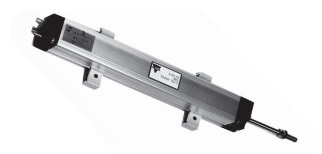
The 115 L is a simply mounted, robust, high precision industrial linear motion transducer.