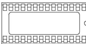
Body Style "A"