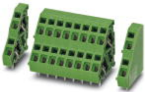
The illustration shows the 10-position version

PCB terminal block, Nominal current: 17.5 A, Nom. voltage: 400 V, Pitch: 5.08 mm, Number of positions: 22, Connection method: Spring-cage connection, Mounting: Soldering, Conductor/PCB connection direction: 45 °, Color: green