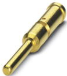
Crimp contact, turned, Contact diameter: 2 mm, Crimp range: 2.5 mm 2 ...4 mm 2

Please be informed that the data shown in this PDF Document is generated from our Online Catalog. Please find the complete data in the user's documentation. Our General Terms of Use for Downloads are valid ( http://phoenixcontact.com/download )