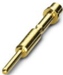
Crimp contact, turned, Single contact, Contact diameter: 1 mm, Crimp range: 0.5 mm 2 ...1 mm 2

Please be informed that the data shown in this PDF Document is generated from our Online Catalog. Please find the complete data in the user's documentation. Our General Terms of Use for Downloads are valid ( http://phoenixcontact.com/download )