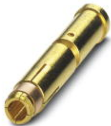
Crimp contact, turned, Contact diameter: 2 mm, Crimp range: 2.5 mm 2 ...4 mm 2

Please be informed that the data shown in this PDF Document is generated from our Online Catalog. Please find the complete data in the user's documentation. Our General Terms of Use for Downloads are valid ( http://phoenixcontact.com/download )