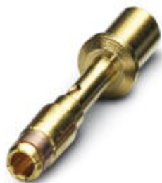
Crimp contact, turned, Single contact, Contact diameter: 2 mm, Crimp range: 4 mm 2 ...4 mm 2

Please be informed that the data shown in this PDF Document is generated from our Online Catalog. Please find the complete data in the user's documentation. Our General Terms of Use for Downloads are valid ( http://phoenixcontact.com/download )