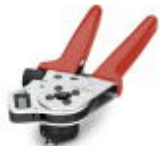
Crimping pliers with digital display

Crimping pliers with digital display - SF-Z0025 - 1607452