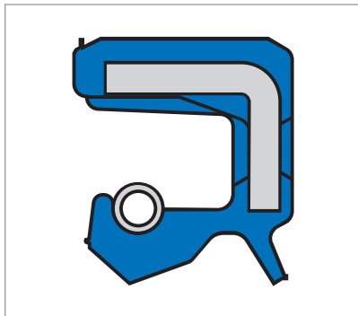
Simmerring BA ...SL