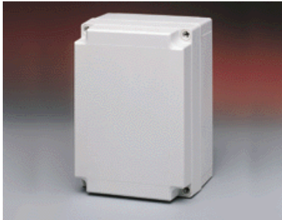
This is a sample photo.