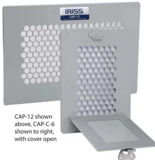
CAP-12 shown above, CAP-C-6 shown to right, with cover open

Available in 6", 12", and 24" widths, CAP Series IR windows allow inspection of multiple component through one window, reducing the total number of windows, associated installation time, and costs.