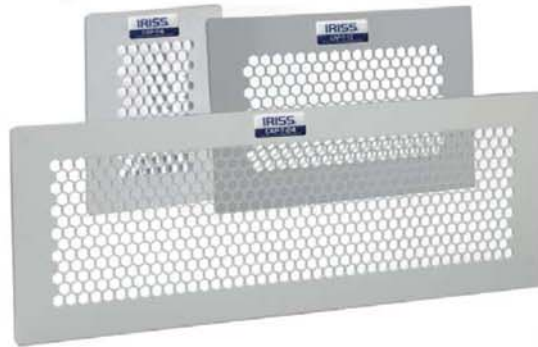
Platinum Series CAP-T shown

The larger rectangular viewing area provides an unparalleled field of view when compared to traditional round IR windows.