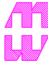
VIEW OF BOX (LID REMOVED)