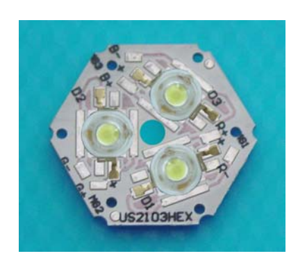
Edixeon Emitters on MCPCB