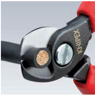
Cut performed with a Cable Shears: easy, clean cut without any deformation of