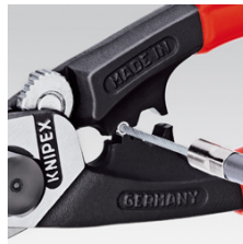
Crimping of the end ferrule onto the traction cable