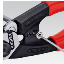
Crimping of the end caps on the Bowden cable sheath