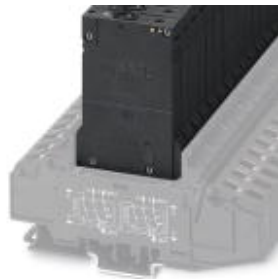
Thermomagnetic circuit breaker, 2-pos., fast blow, 1 N/O contact and 1 N/C contact

Please be informed that the data shown in this PDF Document is generated from our Online Catalog. Please find the complete data in the user's documentation. Our General Terms of Use for Downloads are valid ( http://phoenixcontact.com/download )