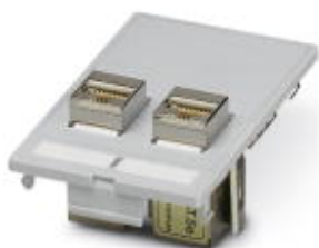
Front plate with contact inserts, plastic, 2x D-SUB 25, socket/pin

Please be informed that the data shown in this PDF Document is generated from our Online Catalog. Please find the complete data in the user's documentation. Our General Terms of Use for Downloads are valid ( http://phoenixcontact.com/download )