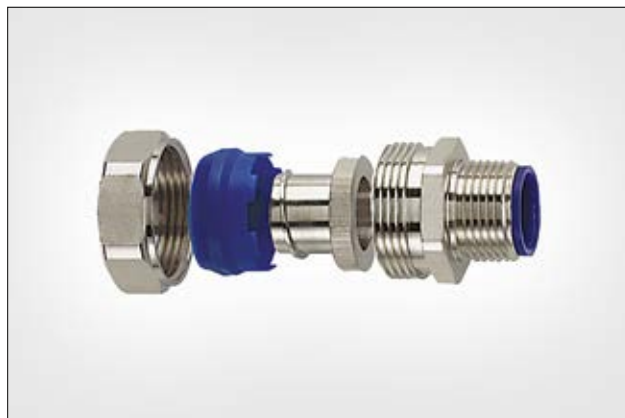
HeloGuard LTS-FMC Compression Fitting.