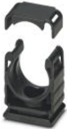
Hose holder with cover

Please be informed that the data shown in this PDF Document is generated from our Online Catalog. Please find the complete data in the user's documentation. Our General Terms of Use for Downloads are valid ( http://phoenixcontact.com/download )