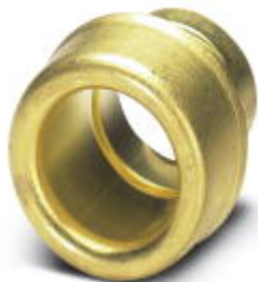
End sleeves as cable protection, made of brass

Please be informed that the data shown in this PDF Document is generated from our Online Catalog. Please find the complete data in the user's documentation. Our General Terms of Use for Downloads are valid ( http://phoenixcontact.com/download )