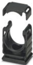
Hose holder with cover

Please be informed that the data shown in this PDF Document is generated from our Online Catalog. Please find the complete data in the user's documentation. Our General Terms of Use for Downloads are valid ( http://phoenixcontact.com/download )