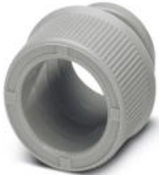
End sleeves as cable protection

Please be informed that the data shown in this PDF Document is generated from our Online Catalog. Please find the complete data in the user's documentation. Our General Terms of Use for Downloads are valid ( http://phoenixcontact.com/download )