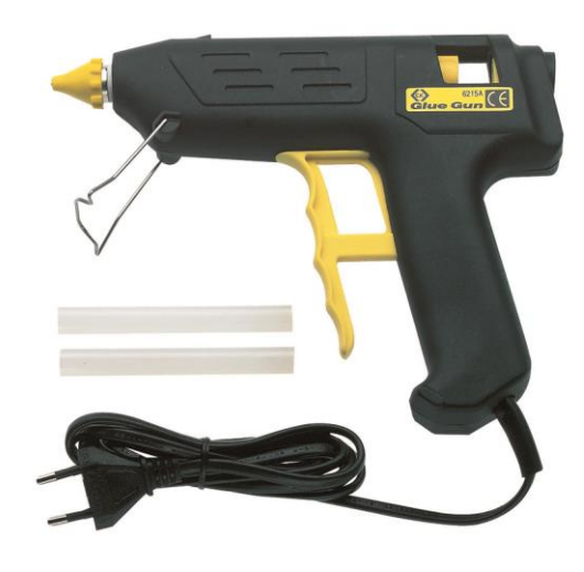
6215A (Euro plug)