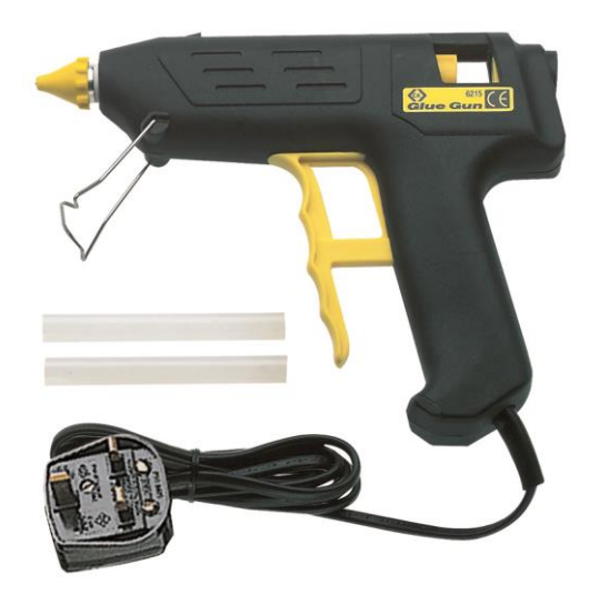
6215 (UK Plug)