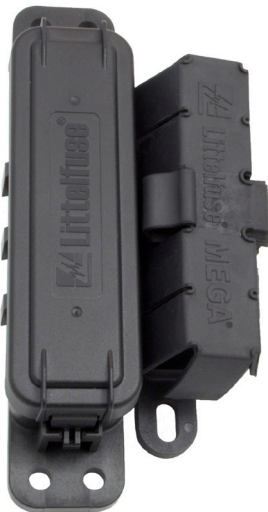
HWA20 interlocked with MEGA-Flex fuseholder (02981028HXFC)

HWA20 interlocks with HWB units, with FLC Power Distribution Modules or bolt-down fuseholders