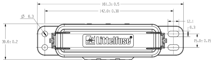
Dimensions in mm