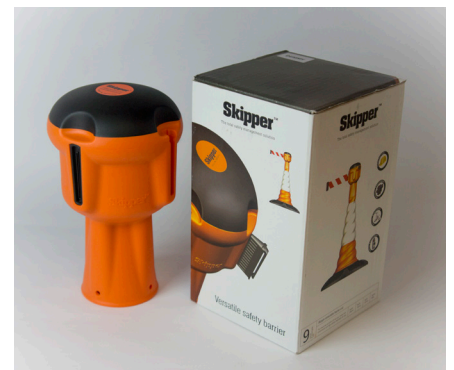
Product and packaging