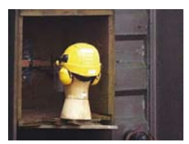
The 3m<sup>™</sup> Peltor<sup>™</sup> Helmet Combination is placed 300 mm from the short-circuit centre.