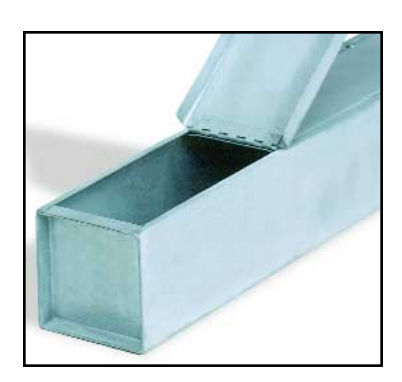
Galvanized steel canister securely holds large quantities of cigarette waste.