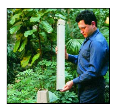
Two-piece design makes cleaning quick and easy.