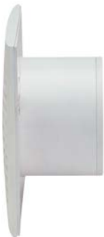
17mm actual profile

With a slim profile of only 17mm, Silhouette blends in with the wall surface to provide an unobtrusive installation. Silhouette has a FID performance of 21 l/s. Silhouette can be ceiling/panel mounted and connected to an appropriate duct run to the outside.